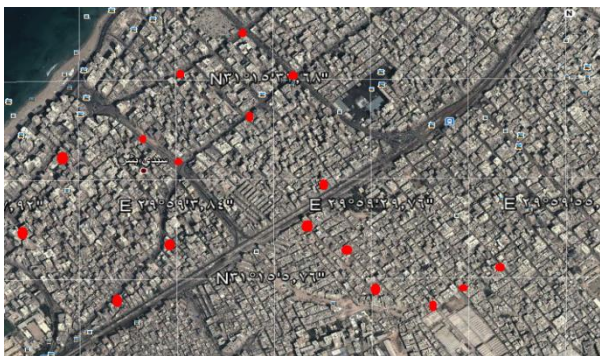
Figure 1. Show the distribution of beans peddlers in Sedi Beshr suburb in Alex. City (Red nodes show street car there).