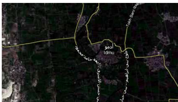
Figure 2. Show the site of Edmo village in Minia governorate